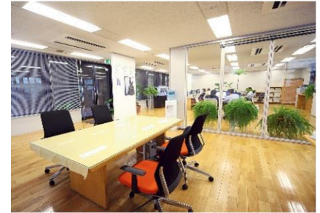
Nagano Head Office

ULTIMATE TECHNOLOGIES ASIA Sdn.Bhd Kuala Lumpur / Malaysia