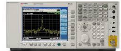
Spectrum analyzer N9010A