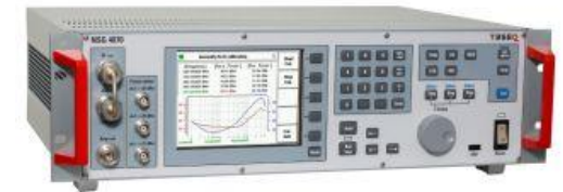
Signal generator with amplifier