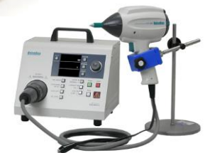
Electrostatic Discharge Tester