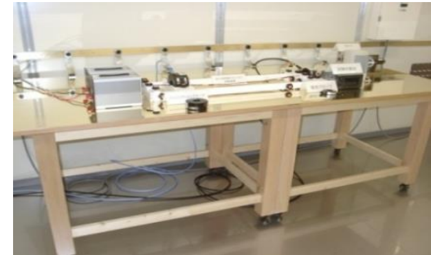
BCI measurement environment